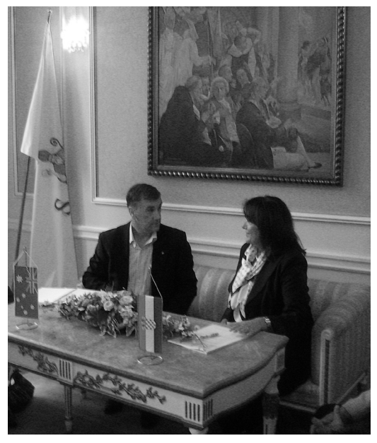
Senator the Hon John Hogg with the Mayor of Dubrovnik, Ms Dubravka Šuica

tourism<sup>13</sup> and related economies (such as hospitality and hotels etc), many of which suffered as a result of the conflict of the 1990s. The local economy is still recovering and with the assistance of central authorities in Zagreb continues to build the economic capacity of the region.