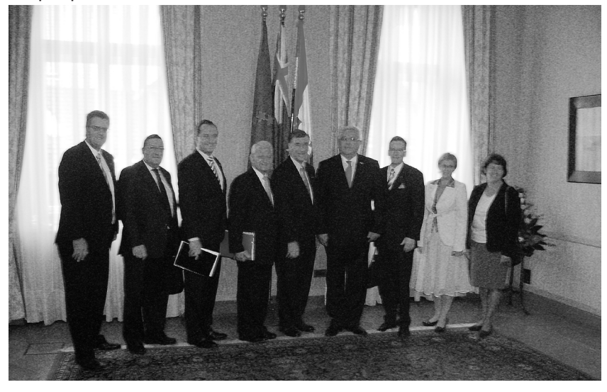
The delegation with the Speaker of the Croatian Parliament, Mr. Luka Bebić

2.39 The Interparliamentary Co-operation Committee, together with the Foreign Policy Committee, oversees the implementation of the foreign policy of the Republic of Croatia within the framework of interparliamentary co-operation with other countries and international organisations in activities of common interest. It facilitates co-operation with representative bodies of other countries and international organisations by establishing joint bodies and friendship groups. It also aligns positions on issues of common interest, and exchange experiences through mutual work exchange programs, documentation and informative materials and bulletins, joint meetings between deputies and exchanges of delegations<sup>9</sup>. The delegation met with the head of this committee, Dr Milorad Pupovac, to discuss the importance and manner in which many thousands of Croatians are returning post-war to their homes and properties. The committee, as part of its national role is administering the restoration of property rights, pensions and public services to displaced people.