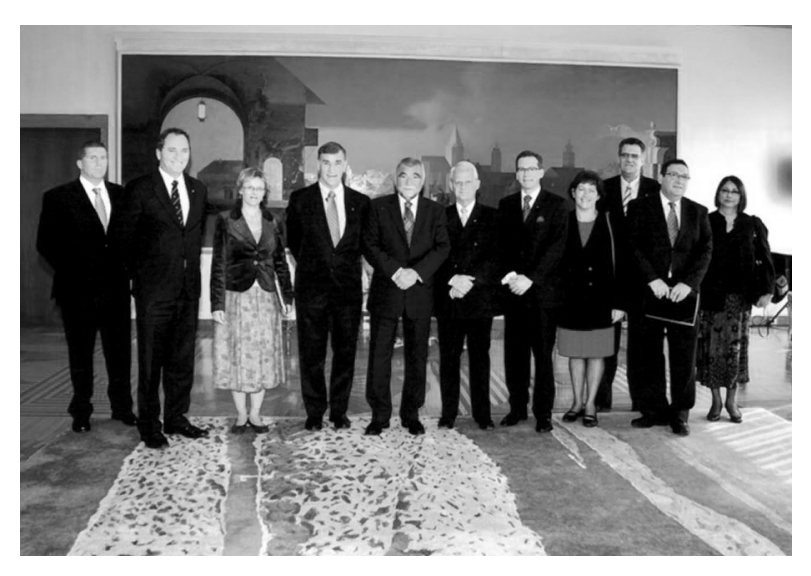
The delegation with the President of the Republic of Croatia, Mr Stjepan Mesić

2.28 The leader of the delegation noted that Australia is very much looking forward to welcoming President Mesic to its shores in early 2009, for a proposed official visit, at which time talks will continue.