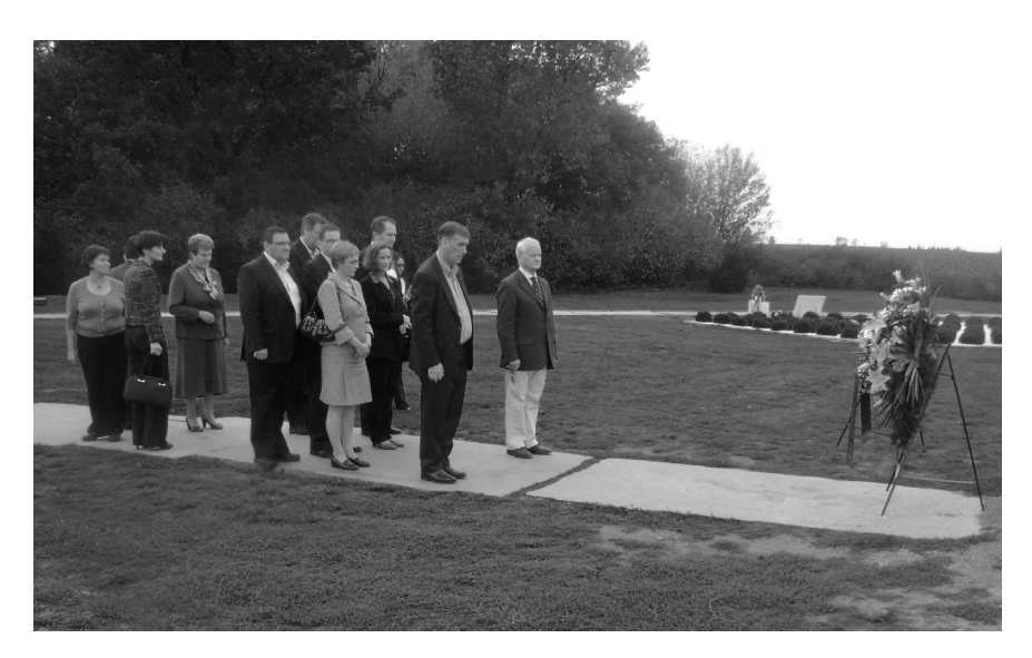
The delegation at the Ovčara Memorial